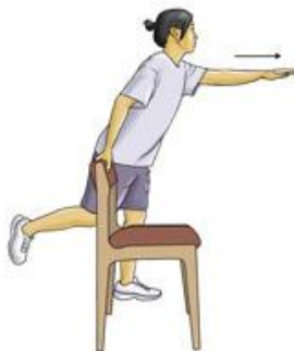
Balance and reach exercise A