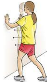
Standing soleus stretch