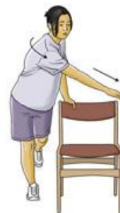
Balance and reach exercise B