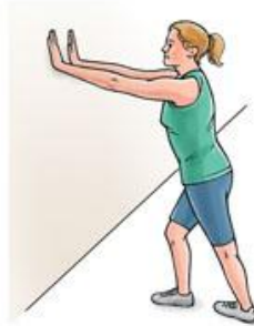
Standing calf stretch